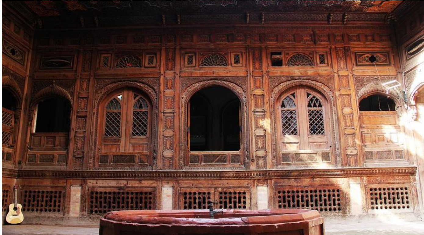
Sethi Mohallah Peshawar City, famous for Central-Asian style homes, built in late 19 th Century

WINTER VACATIONS (21 st – 29 th December, 2019)