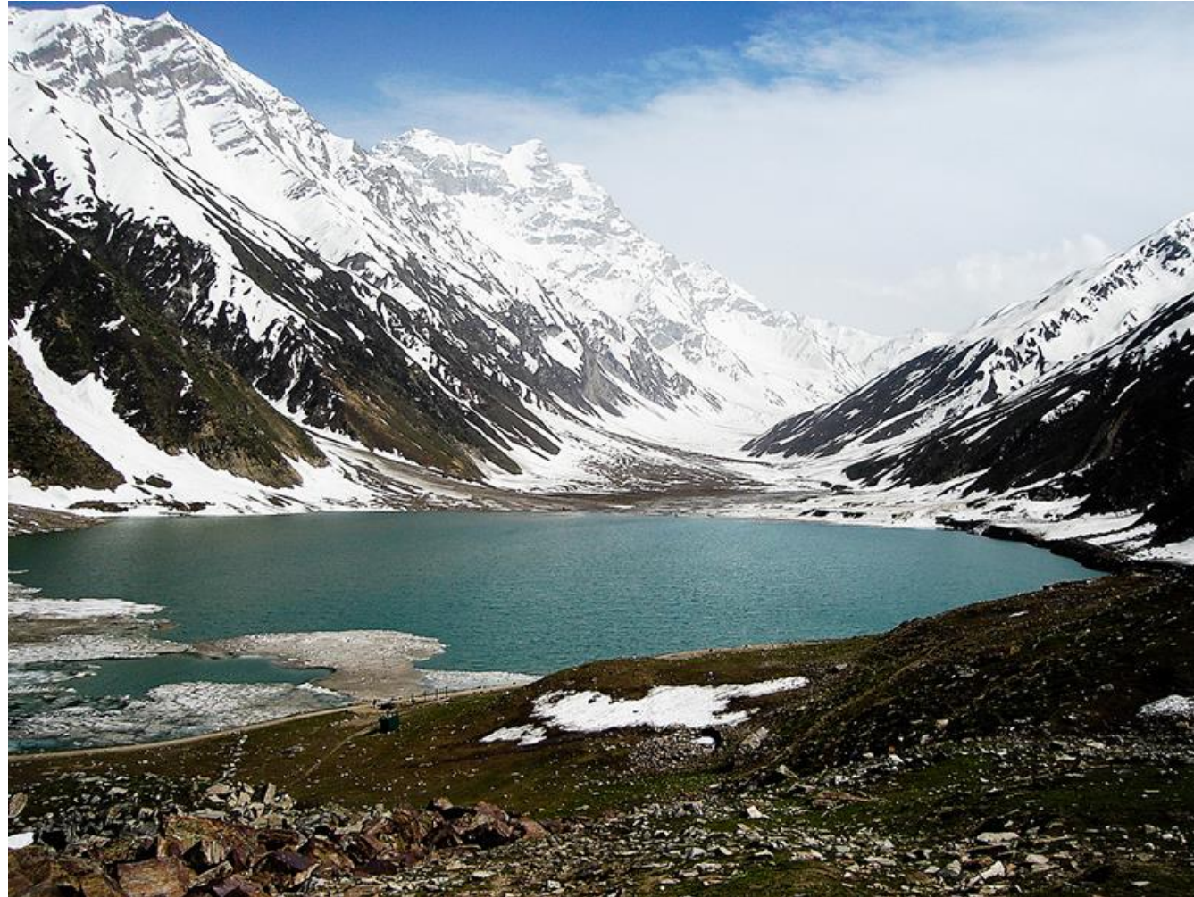
Lake Saiful Muluk near Naran is one of the highest lakes in Pakistan (10,578 feet above sea level)

WINTER VACATIONS (21 st - 29 th December, 2019)