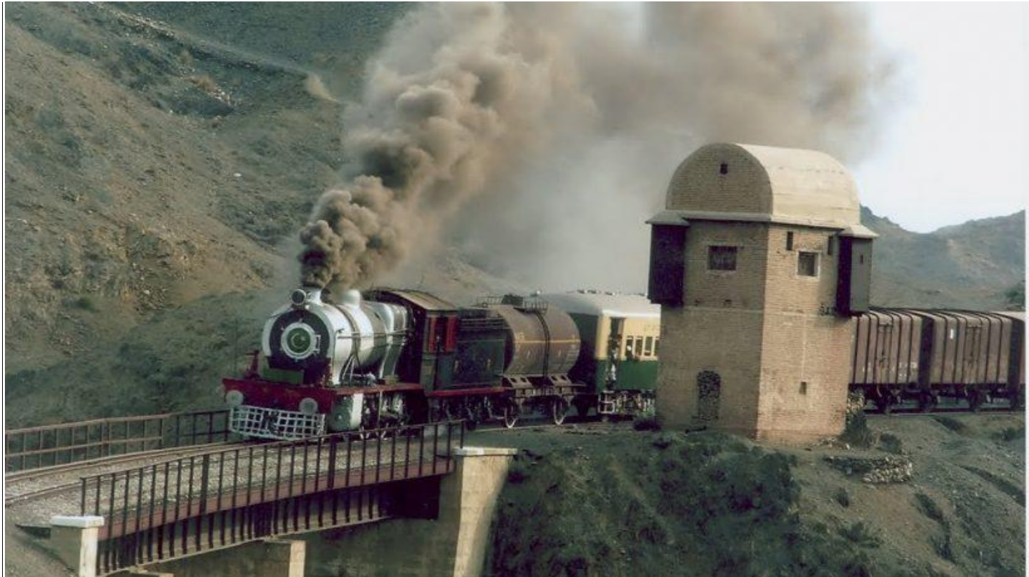
Steam locomotive service along the Khyber Pass to Landi Kotal, covering a distance of 32 miles through 34 tunnels and 92 bridges (started in 1925)

SPRING VACATIONS (4 th – 12 th April, 2020)