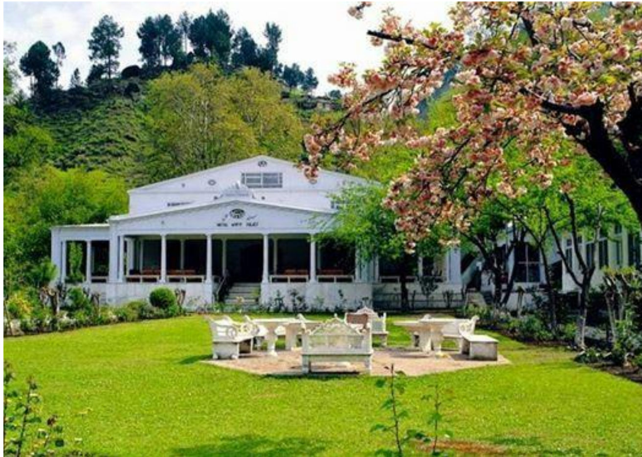
White Palace Swat, built by the first King of Swat Miangul Abdul Wadud (Badshah Sahib) in 1940

SUMMER VACATIONS (13 th June – 30 th August, 2020)